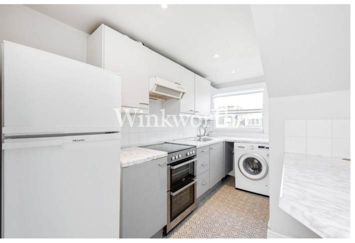
ALEXANDRA GROVE, FINSBURY PARK, N4 £535,000 SHARE OF FREEHOLD