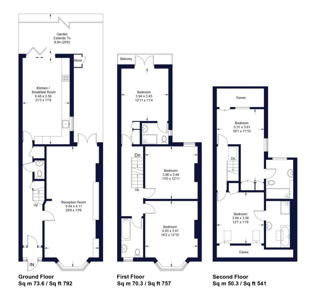
Illustration for identification purposes only, measurements are approximate, not to scale. FloorplansUsketch.com © 2020 (ID715752)