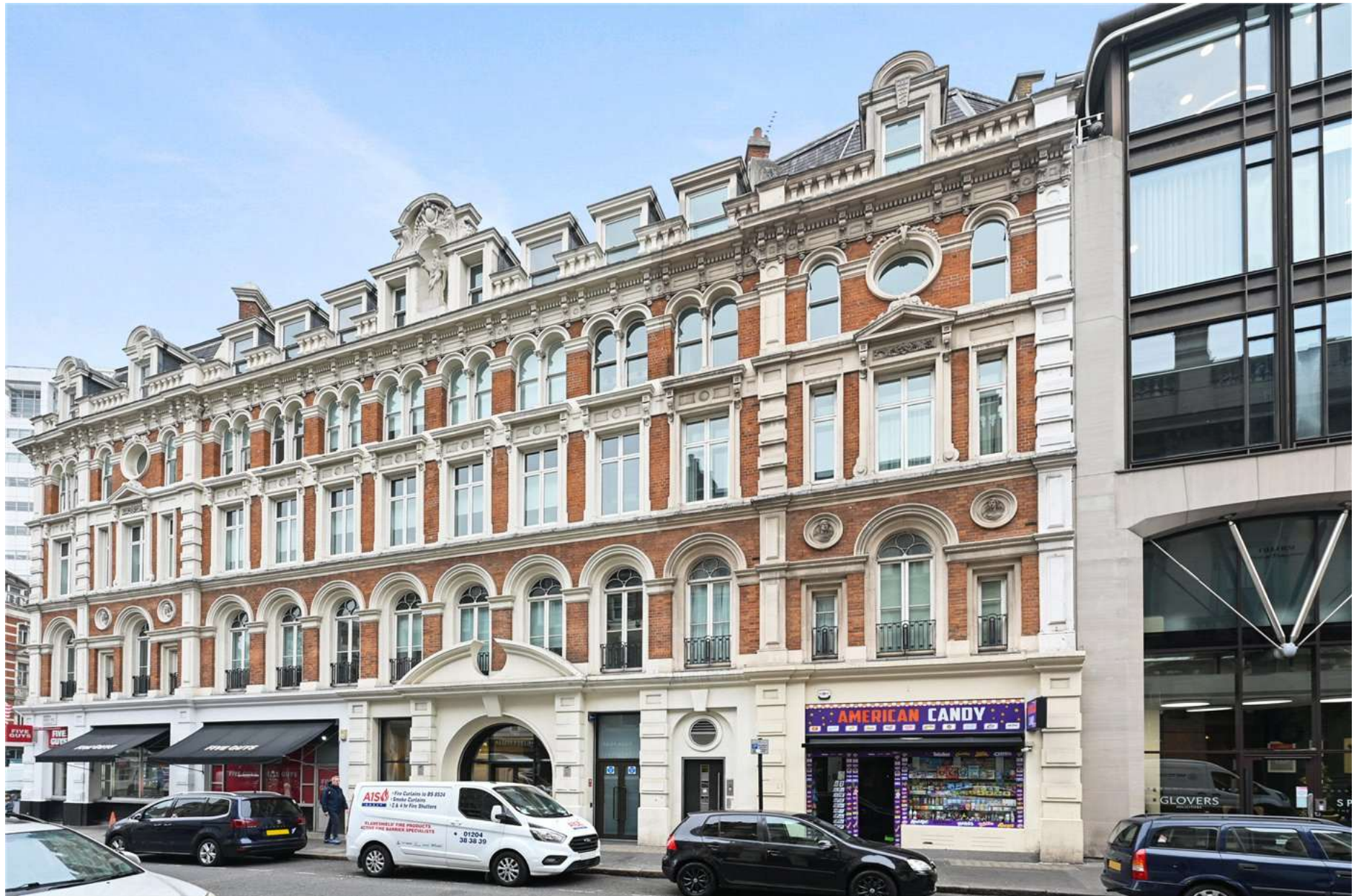
GARRICK STREET, WC2E £1,250,000 LEASEHOLD