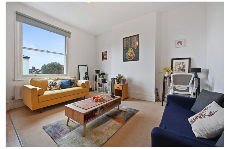
UXBRIDGE ROAD, LONDON, W12