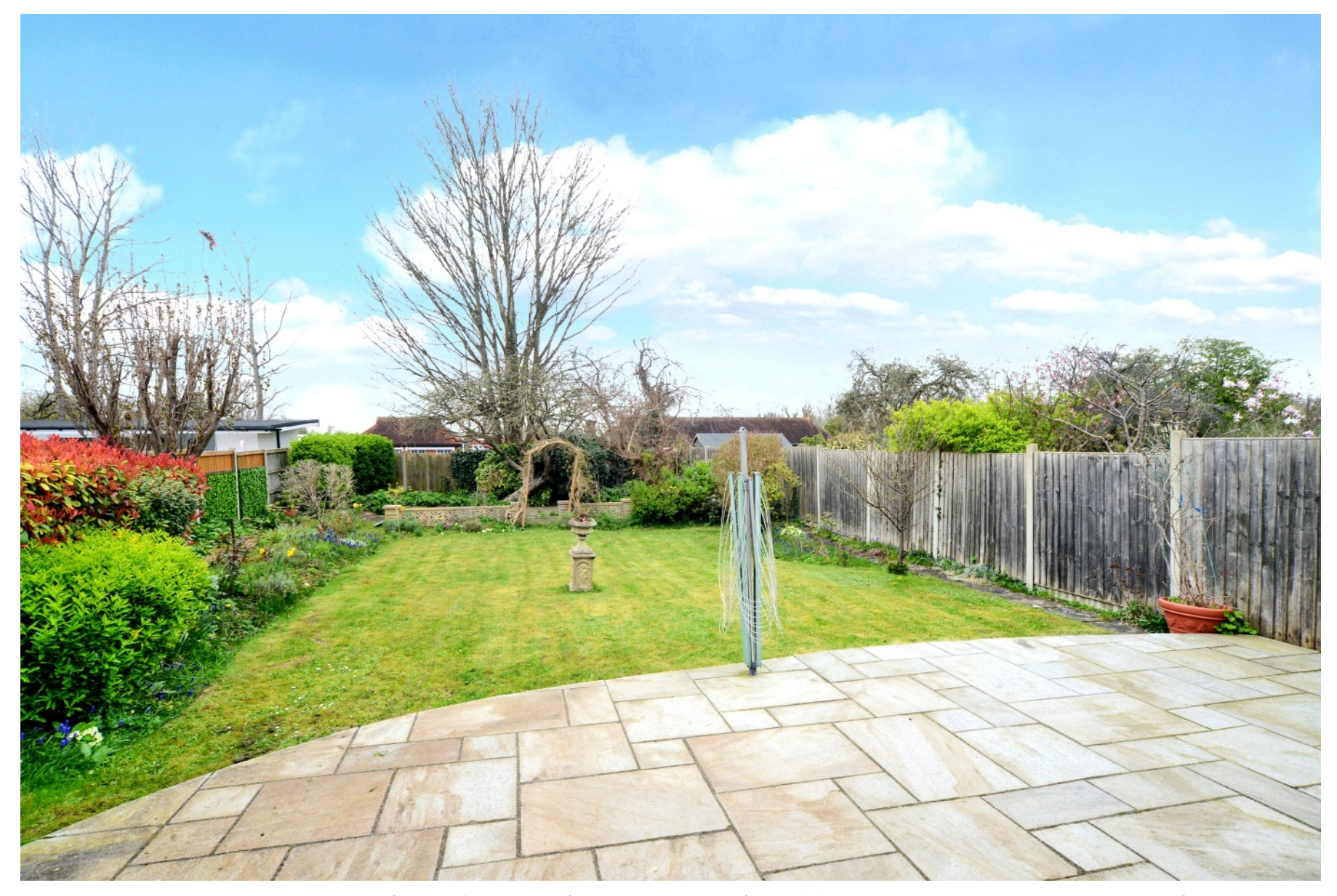
Under the Consumer Protection Regulations 2008, these Particulars are a guide and act as information only. All details are given in good faith and are believed to be correct at time of printing. Winkworth give no representation as to their accuracy and potential purchasers or tenants must satisfy themselves by inspection or otherwise as to their correctness. No employee of Winkworth has authority to make or give any representation or warranty in relation to this property.