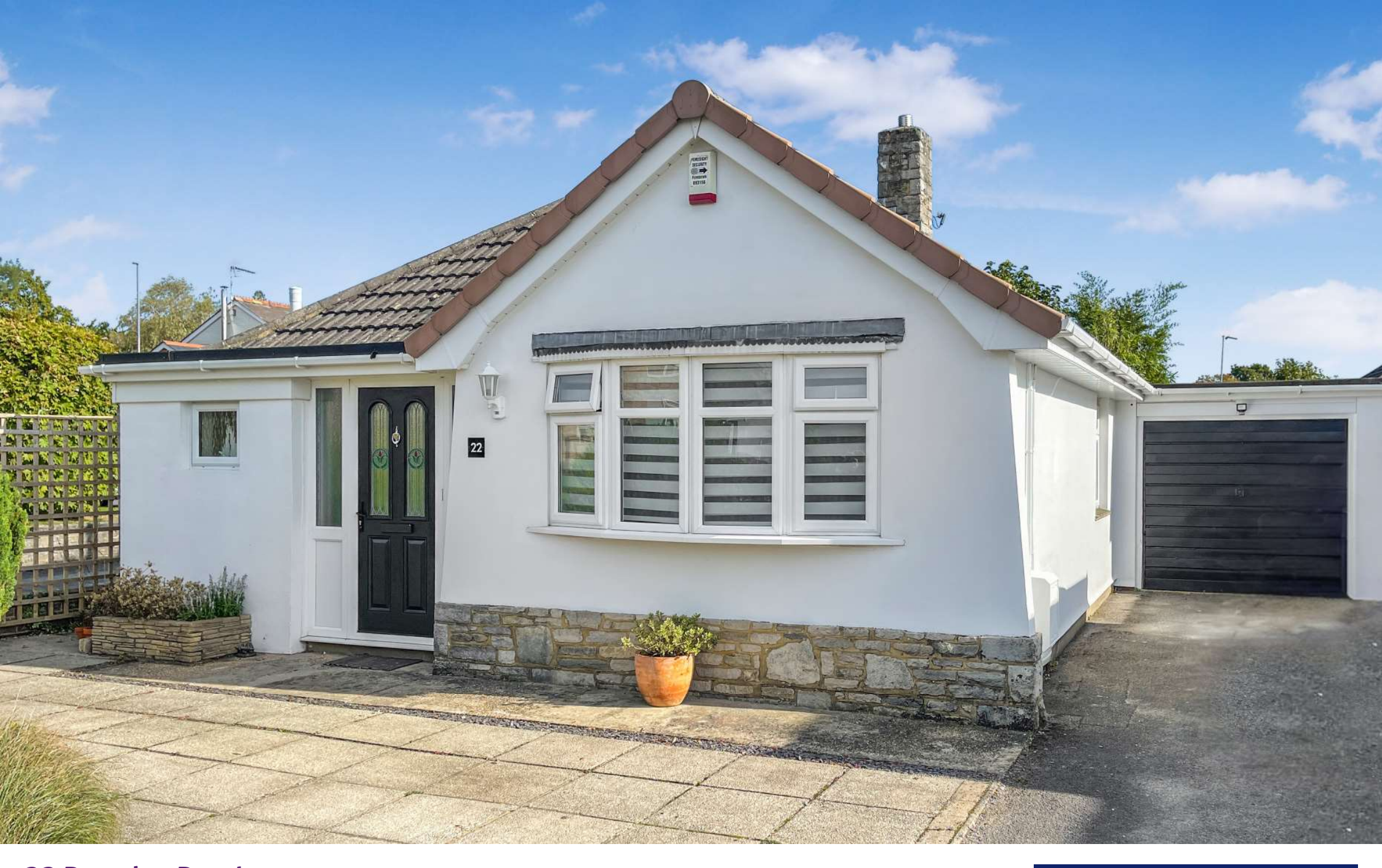
22 Bramley Road Ferndown BH22 9JJ Offers In Excess Of £500,000