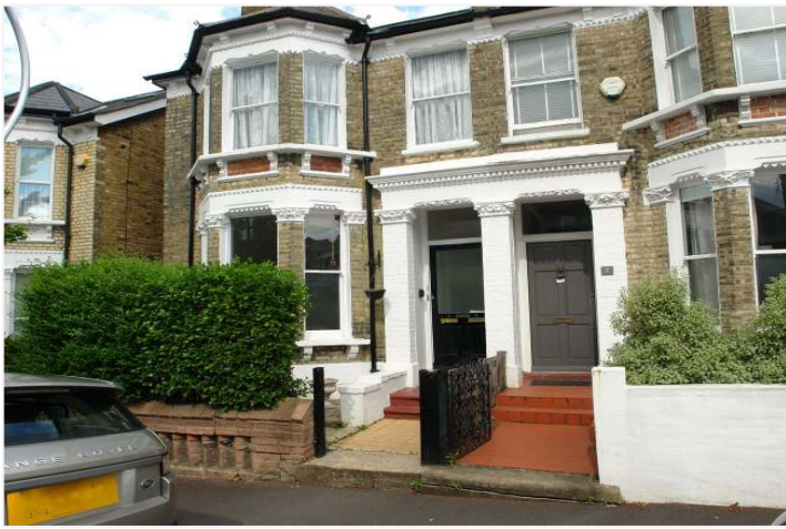
MUSCHAMP ROAD, PECKHAM RYE, SE15 OIEO £475,000 LEASEHOLD