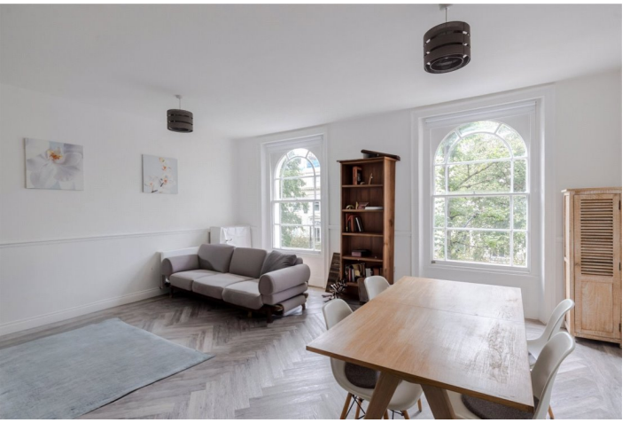
INVERNESS TERRACE, BAYSWATER, W2 £1,100,000 LEASEHOLD

ONLY MOMENTS FROM HYDE PARK AND KENSINGTON GARDENS, A RECENTLY REFURBISHED, STYLISHLY PRESENTED, TWO BEDROOM, TWO BATHROOM, SECOND FLOOR (WITH LIFT) APARTMENT, SET IN THIS HANDSOME GRADE II PERIOD BUILDING.