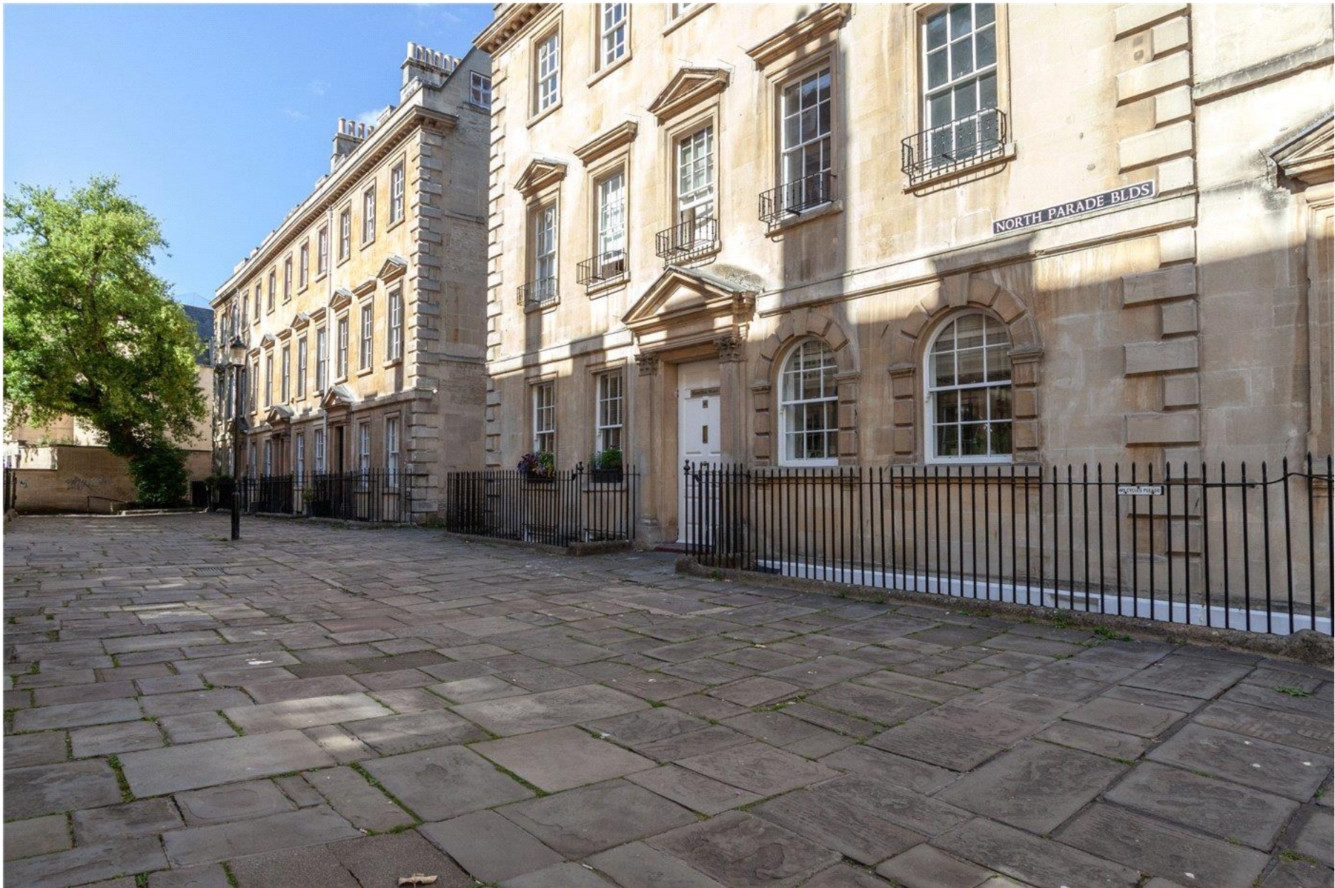
NORTH PARADE BUILDINGS, SOMERSET, BA1 £315,000 SHARE OF FREEHOLD