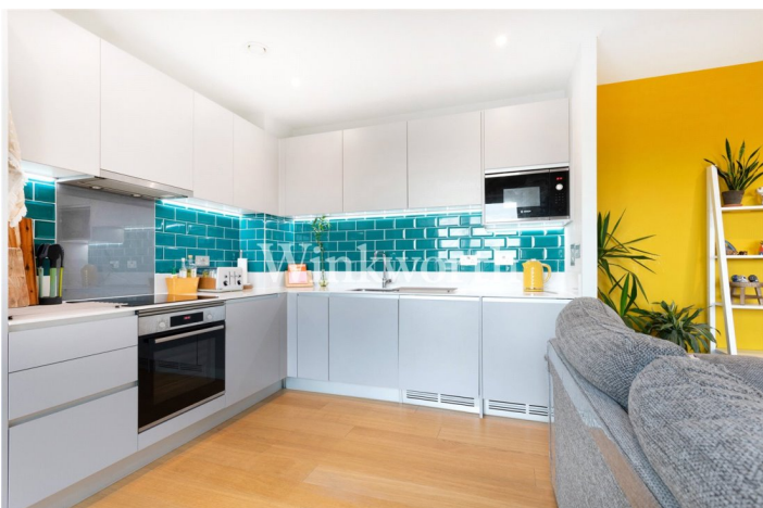
HALE WHARF, LONDON, N17 £400,000 LEASEHOLD