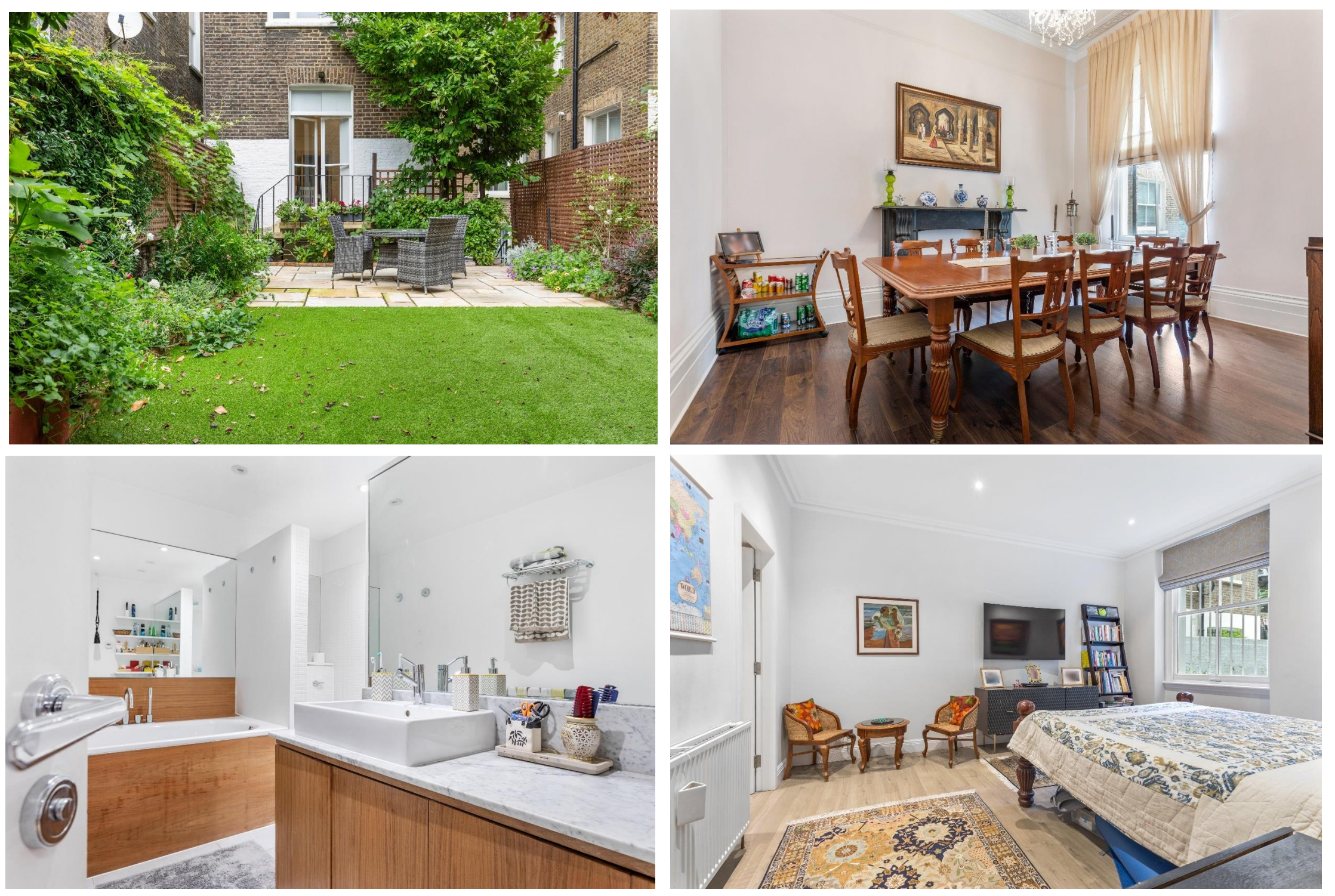
Split-Level | South facing garden | four bedrooms | four bathrooms