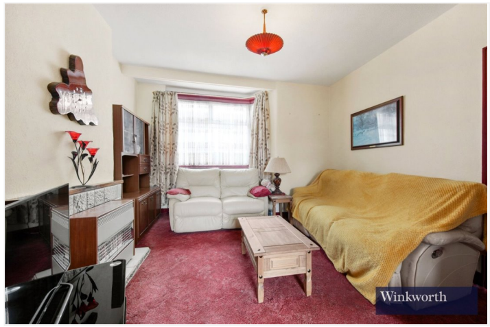
BYRON ROAD, HARROW, HA3 £460,000 FREEHOLD