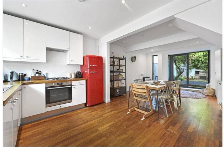
HILLGATE PLACE, W8 £2,100,000 FREEHOLD

A CHARMING THREE BEDROOM VICTORIAN TERRACED HOUSE WITH LARGE GARDEN SITUATED IN THE HEART OF HILLGATE VILLAGE.