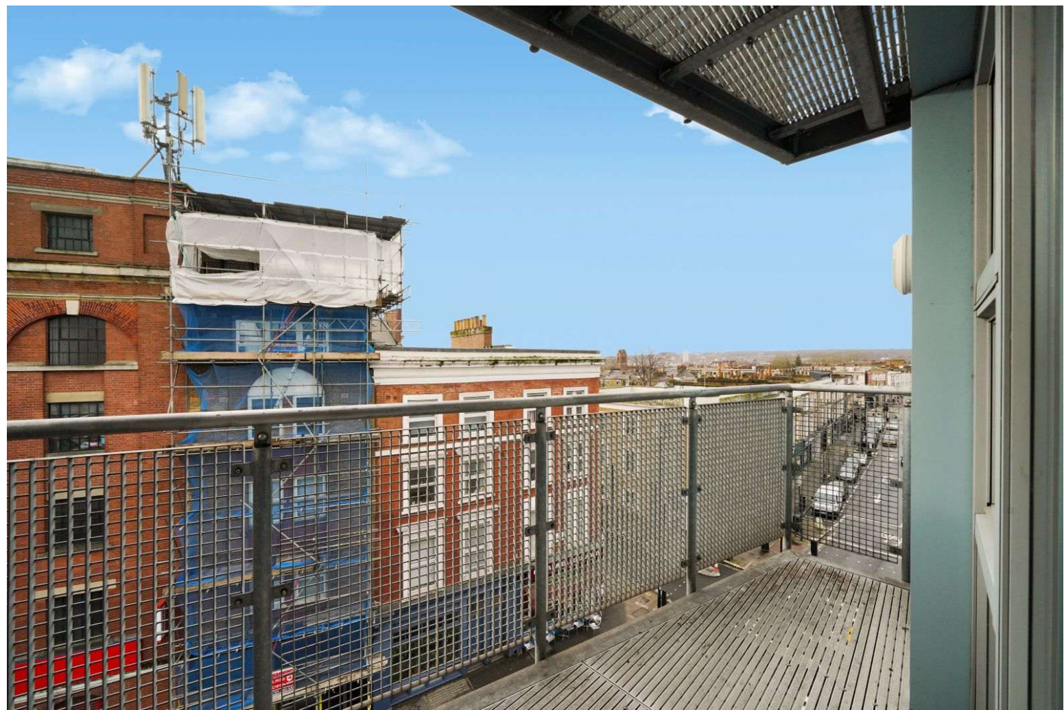
Views from balcony