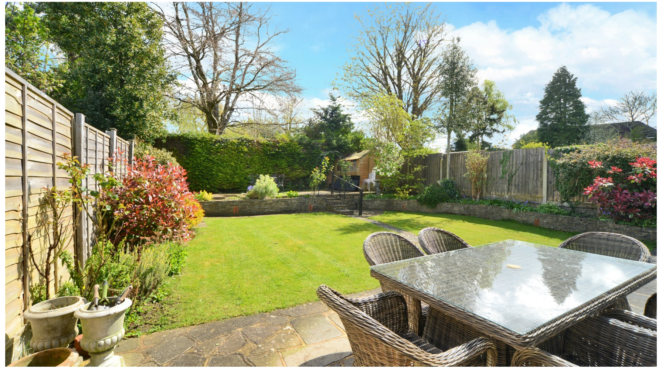
Under the Consumer Protection Regulations 2008, these Particulars are a guide and act as information only. All details are given in good faith and are believed to be correct at time of printing. Winkworth give no representation as to their accuracy and potential purchasers or tenants must satisfy themselves by inspection or otherwise as to their correctness. No employee of Winkworth has authority to make or give any representation or warranty in relation to this property.