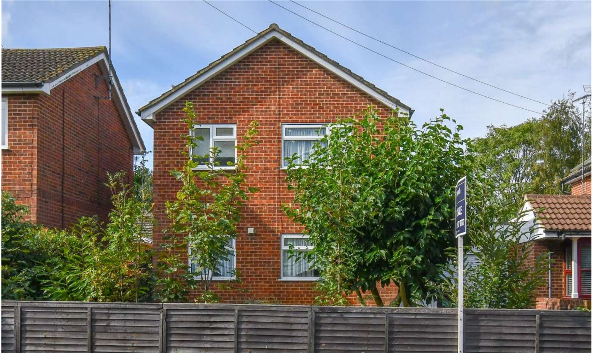
15 GORSE RIDE SOUTH, FINCHAMPSTEAD, WOKINGHAM, BERKSHIRE, RG40 4EH £450,000 FREEHOLD