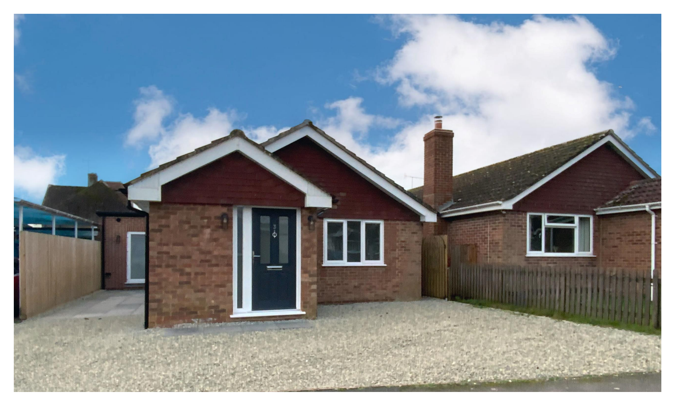
Thoroughly modern three-bedroom bungalow in Great Bedwyn. Guide Price £475,000