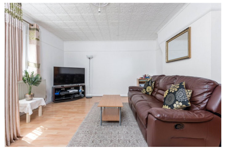
ARTHUR DEAKIN HOUSE, HUNTON STREET, E1 'OFFERS OVER' £450,000 LEASEHOLD