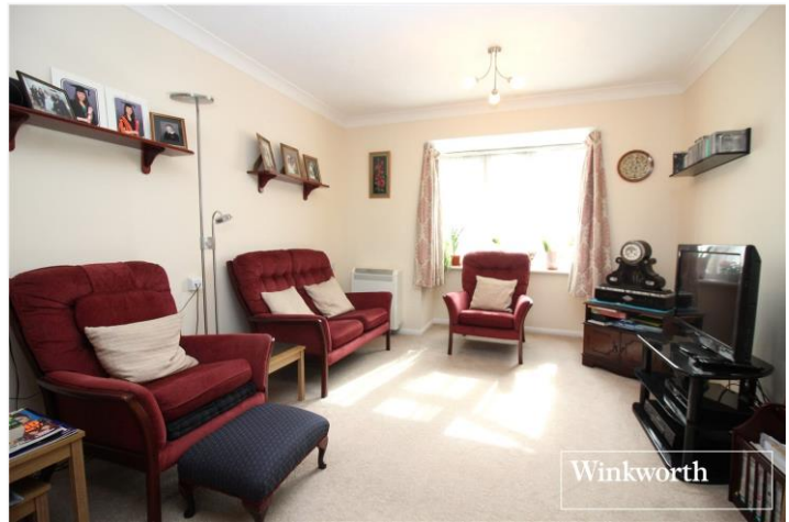
FURZEHILL ROAD, HERTFORDSHIRE, WD6 £199,950 LEASEHOLD