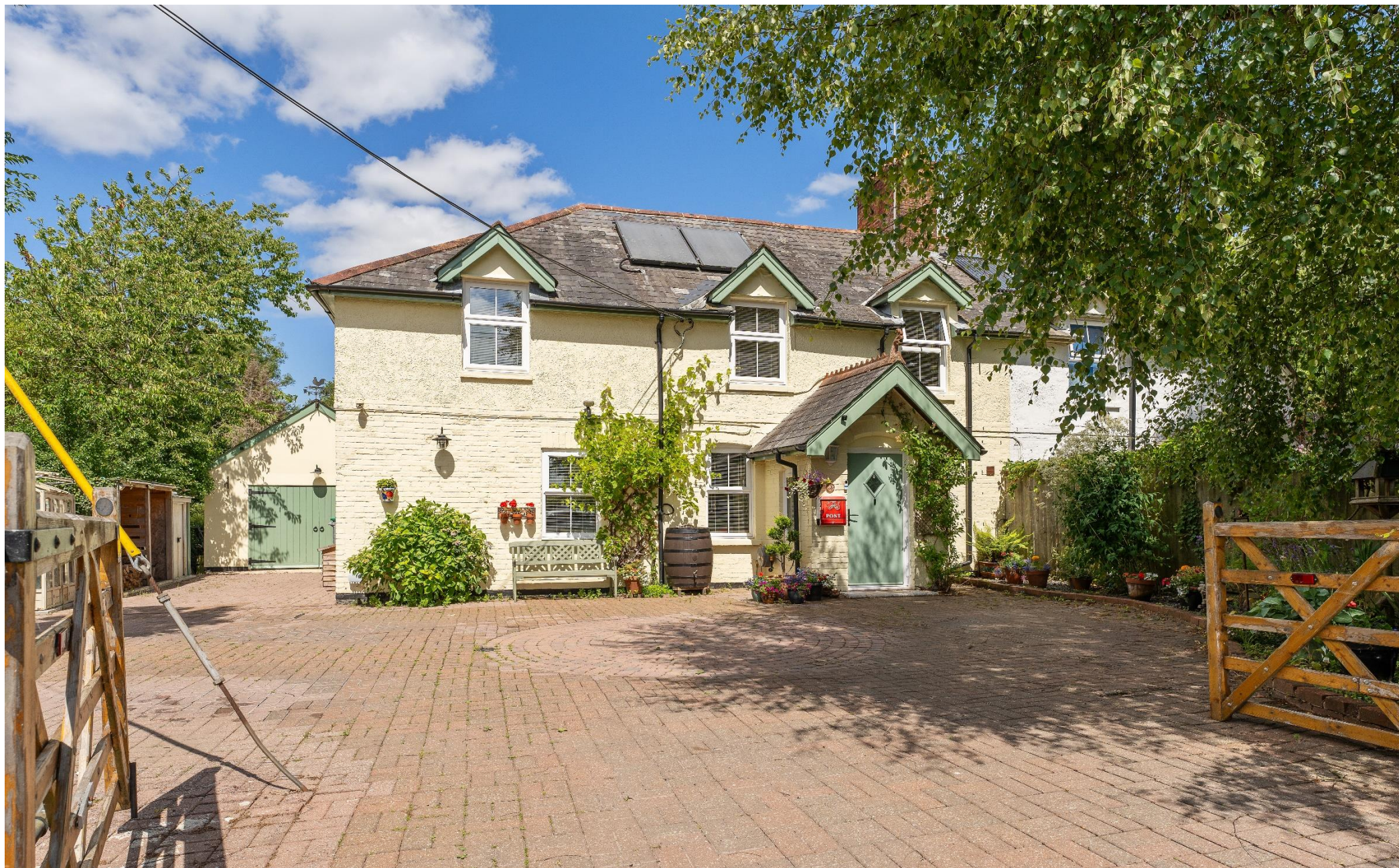
3 Lake Cottages, Carters Clay, Lockerley SO51 0GN Guide Price £750,000