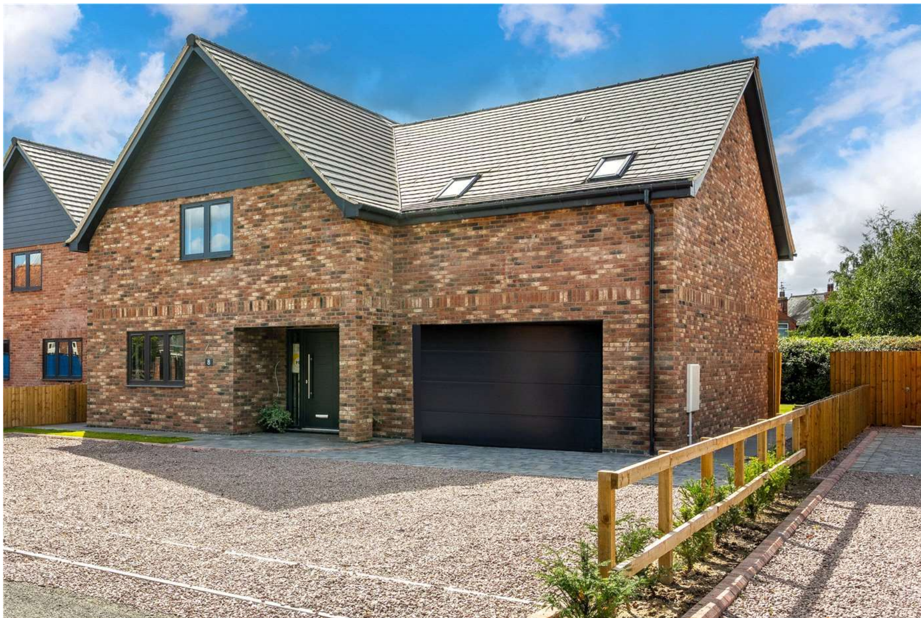
8 BEAR LANE, SPALDING, LINCOLNSHIRE, PE11 3XA £540,000 FREEHOLD