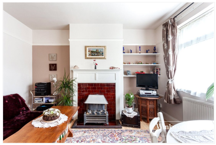
STATION ROAD, LONDON, N3 £450,000 SHARE OF FREEHOLD