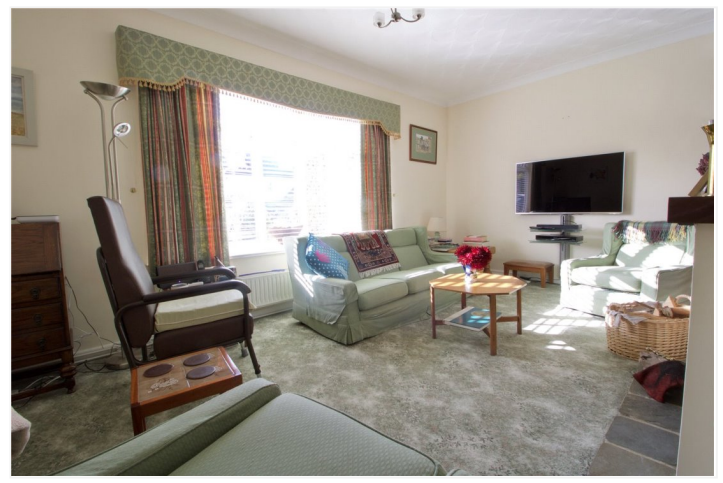
1 WIDDEN CLOSE, SWAY, LYMINGTON, HAMPSHIRE, SO41 £399,950 FREEHOLD

A SPACIOUS TWO BEDROOM DETACHED BUNGALOW SET ON A DELIGHTFULLY SECLUDED PLOT WITH A LARGE REAR SUN LOUNGE, INTEGRAL GARAGE AND TWO RECEPTION ROOMS.