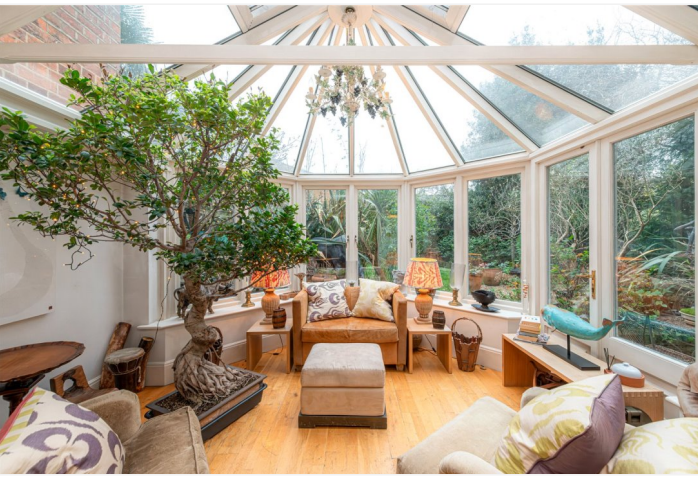
BREWSTER GARDENS, LONDON, W10 £9,950 PER MONTH