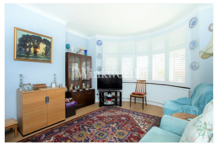
CRAWFORD GARDENS, N13 £650,000 FREEHOLD

A WELL-MAINTAINED FAMILY HOME WITH A GENEROUSLY SIZED REAR GARDEN BACKING ONTO THE NEW RIVER.