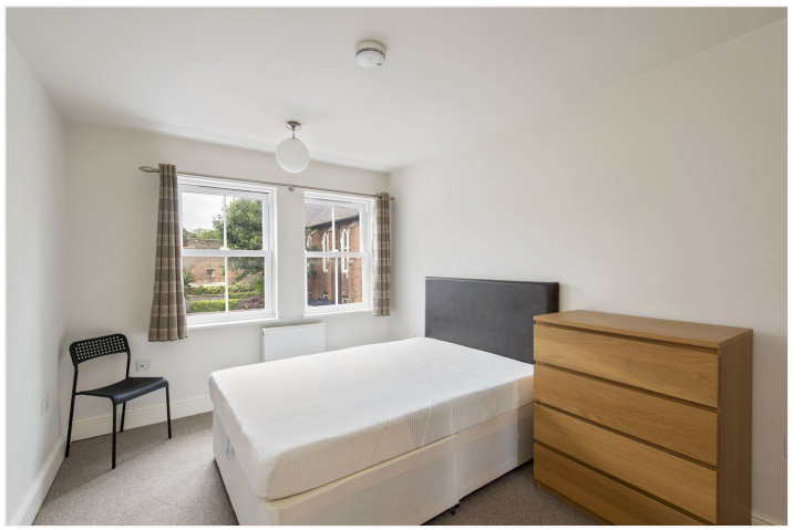
GUERNSEY GROVE, SE24 £1,395 PER MONTH FURNISHED