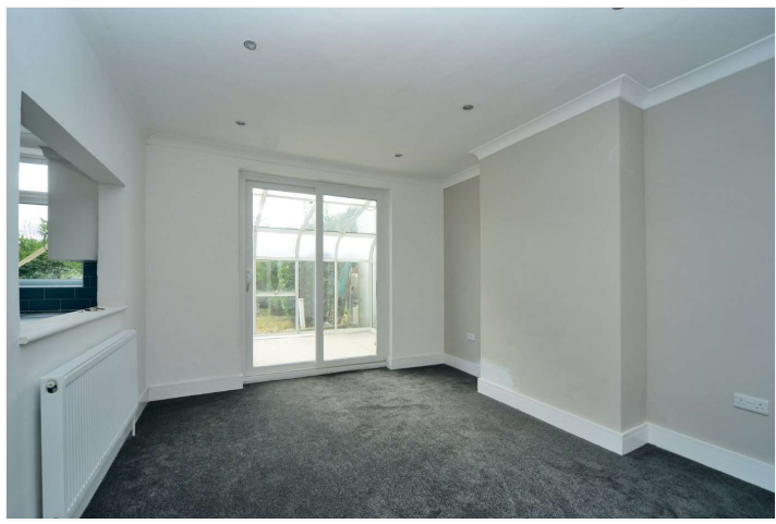
HEMINGFORD ROAD, CHEAM, SUTTON, SM3 £725,000 FREEHOLD

A SPACIOUS FOUR BEDROOM SEMI DETACHED PROPERTY BENEFITTING FROM LARGE ROOM SIZES AND A 140FT APPROX. SOUTH WESTERLY FACING REAR GARDEN