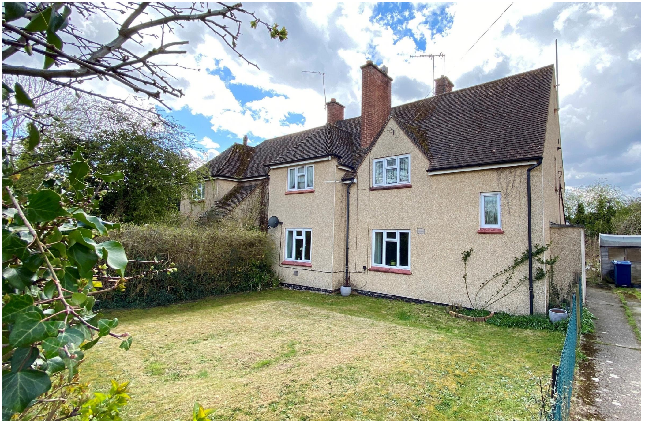
25 HEARNES MEADOW, SEER GREEN, BEACONSFIELD, BUCKS, HP9 2YJ