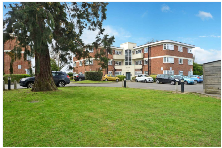
BENHILL WOOD ROAD, SUTTON, SM1 £280,000 LEASEHOLD

A CHARACTERFUL, ART DECO, TOP FLOOR, TWO BEDROOM APARTMENT WITH BALCONY SET WITHIN EASY REACH OF SUTTON TOWN CENTRE