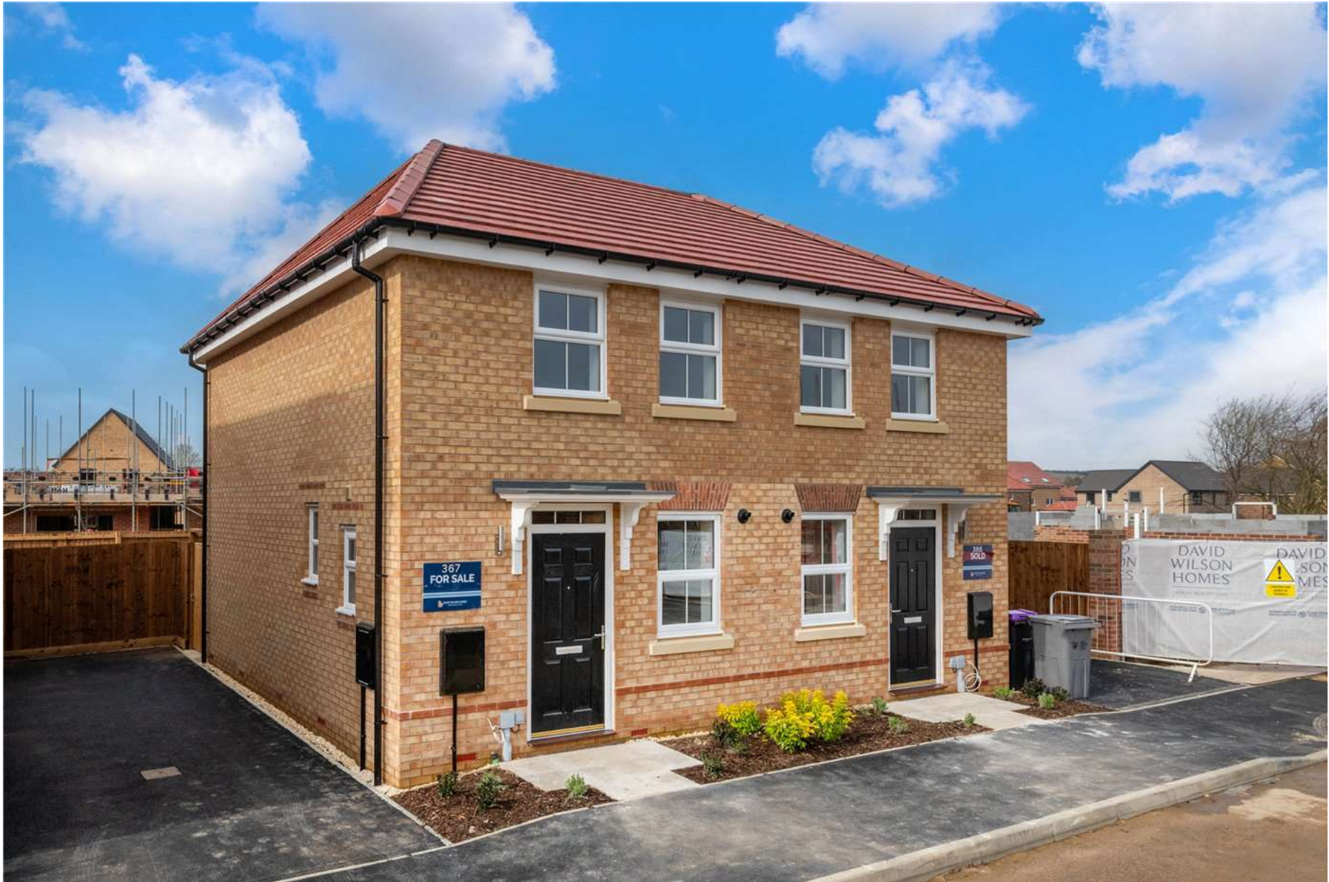
THE WILFORD, MUSSELBURGH WAY, BOURNE, PE10 0XY £209,995 FREEHOLD