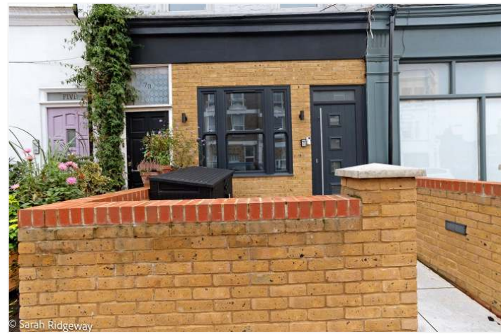
NORTH CROSS ROAD, EAST DULWICH, SE22 OFFERS IN EXCESS OF £550,000 FREEHOLD