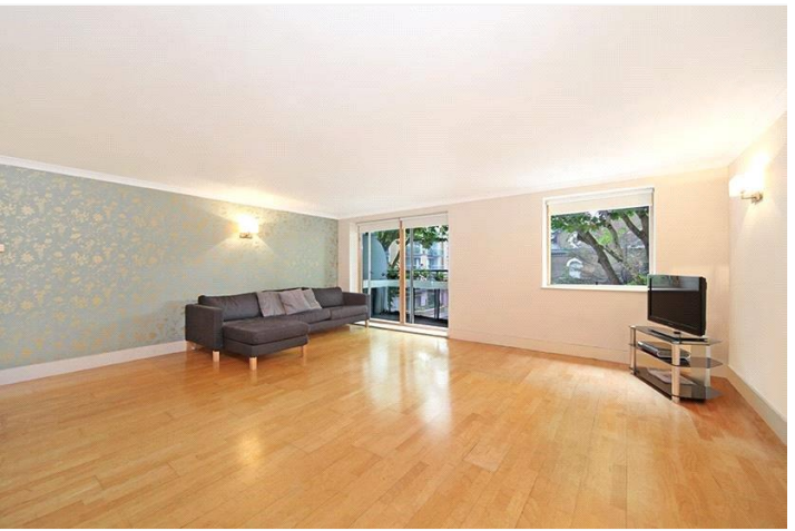
CHISWICK HIGH ROAD, CHISWICK, LONDON, W4 £2,600 PER MONTH FURNISHED