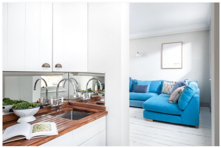
LAMBTON PLACE, W11 £695,000 LEASEHOLD (112 YEARS REMAINING)

A PERFECTLY PROPORTIONED, BRIGHT AND CHARMING, ONE BEDROOM FLAT TUCKED AWAY IN THIS QUITE MEWS, JUST OFF WESTBOURNE GROVE