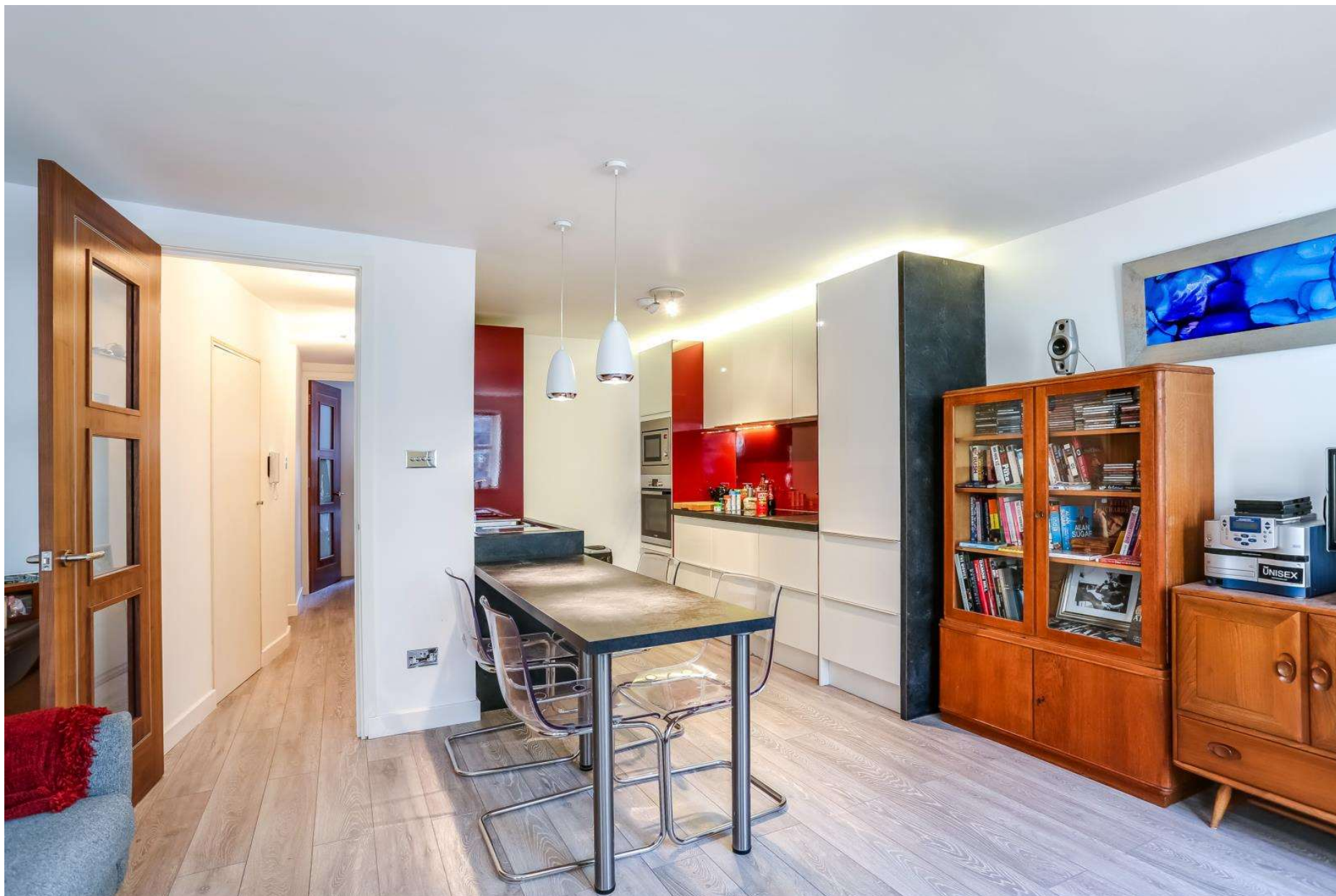
VERITY CLOSE, LONDON, W11 £1,995 PER MONTH FURNISHED