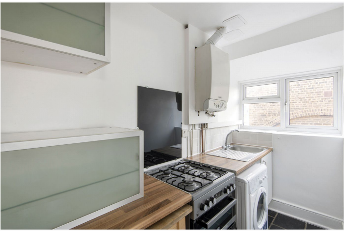
MOUNT EPHRAIM ROAD, LONDON, SW16 £1,595 PER MONTH UNFURNISHED