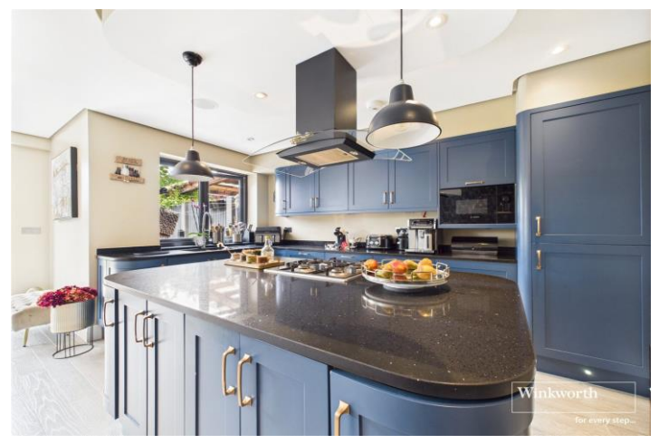
BEVERLEY DRIVE, EDGWARE, MIDDLESEX, HA8 £1,100,000 FREEHOLD