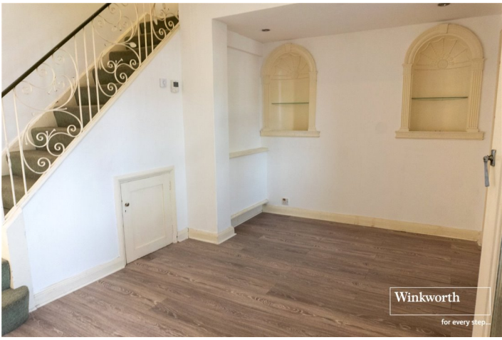
BARN HILL, WEMBLEY, MIDDLESEX, HA9 £1,475,000 FREEHOLD