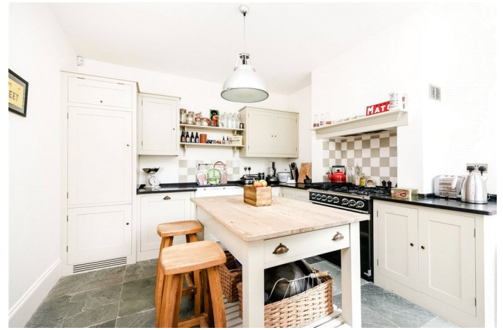
NORTHOLME ROAD, HIGHBURY, N5 £2,200,000 FREEHOLD

A STUNNING, 5 BEDROOM, 3 BATHROOM FAMILY HOME WITH SOUTH FACING GARDEN IN HIGHBURY, N5.