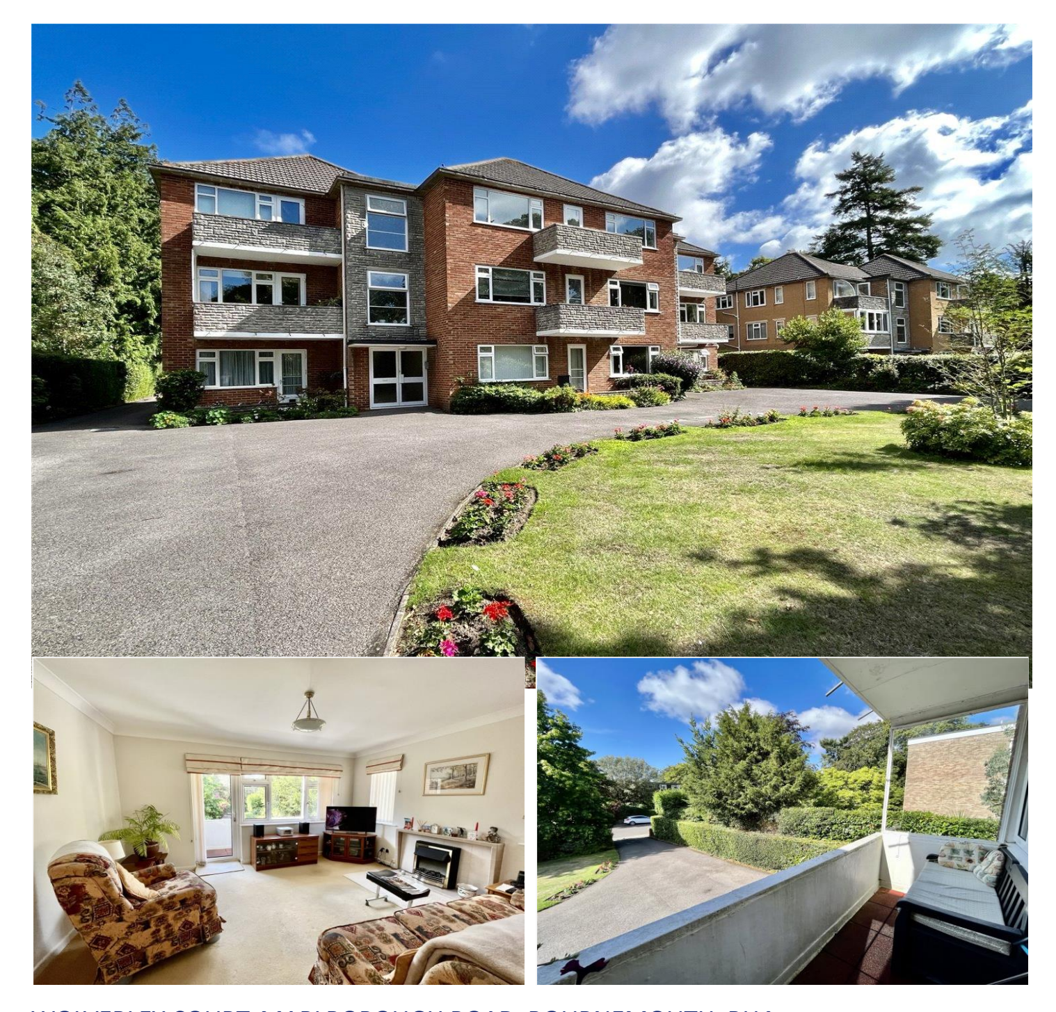
WOLVERLEY COURT, MARLBOROUGH ROAD, BOURNEMOUTH, BH4