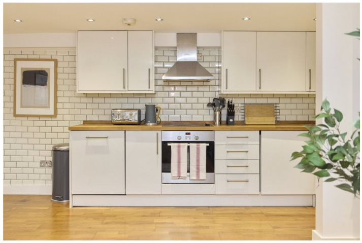
BASEMENT FLAT, MILDENHALL ROAD, LONDON, E5 £450,000 LEASEHOLD