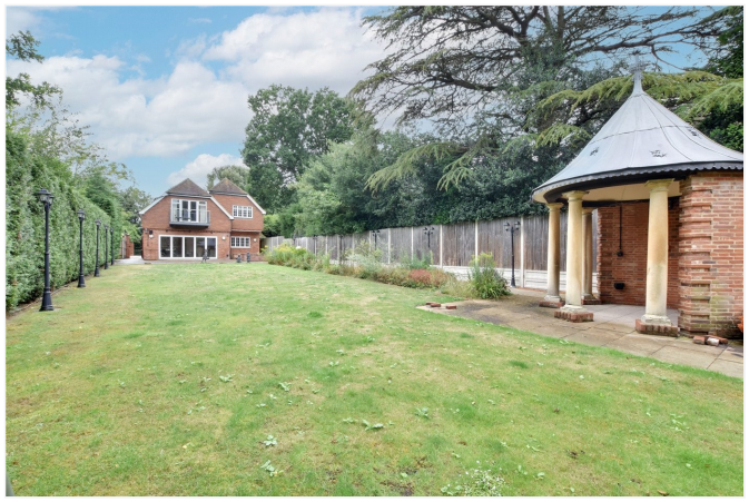
KEMNAL ROAD, BR7 OIRO £1,900,000 FREEHOLD

CHAIN FREE! INTRODUCING TO THE MARKET THIS DECEPTIVELY LARGE 5-BEDROOM DETACHED HOUSE MEASURING OVER 6,500SQFT ACROSS THREE FLOORS OFFERING PLENTY OF VERSATILITY AND BEING SET ON ONE OF CHISLEHURST'S MOST PRESTIGIOUS ROADS BEING WITHIN EASY REACH OF THE HIGH STREET AND ROYAL PARADE.