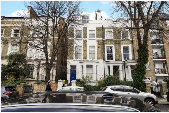
ST. LUKES ROAD, W11 OIEO £700,000 SHARE OF FREEHOLD (974 YEARS REMAINING)

A BRIGHT AND RECENTLY REFURBISHED TWO-BEDROOM DUPLEX APARTMENT ON THIS PEACEFUL, TREE LINED NOTTING HILL STREET.