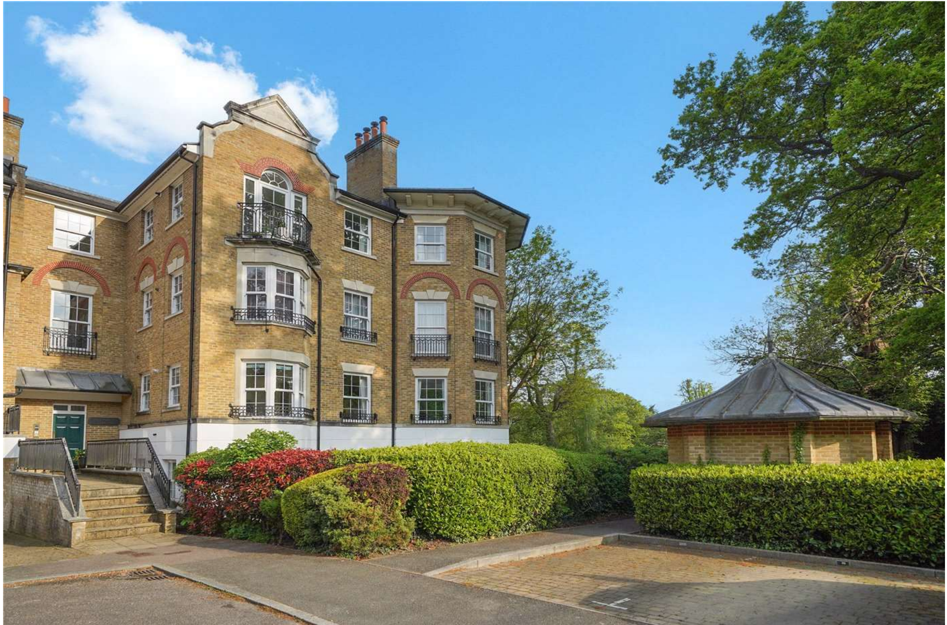
CHAPMAN SQUARE, SW19 £795,000 LEASEHOLD