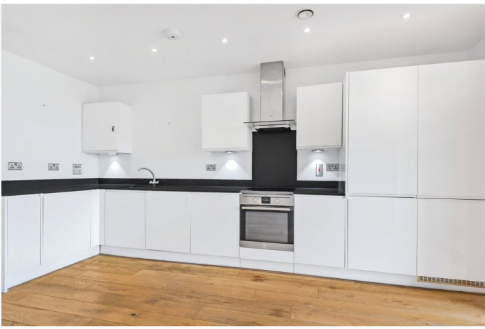
BLACKWALL LANE, GREENWICH, LONDON, SE10 GUIDE PRICE £350,000-£360,000 LEASEHOLD

A SUPERB ONE BEDROOM APARTMENT, THAT MEASURES CIRCA 553 SQUARE FOOT, WHICH IS WELL LOCATED CLOSE TO THE RIVER WALK, ON THE BORDERS OF NORTH AND EAST GREENWICH.