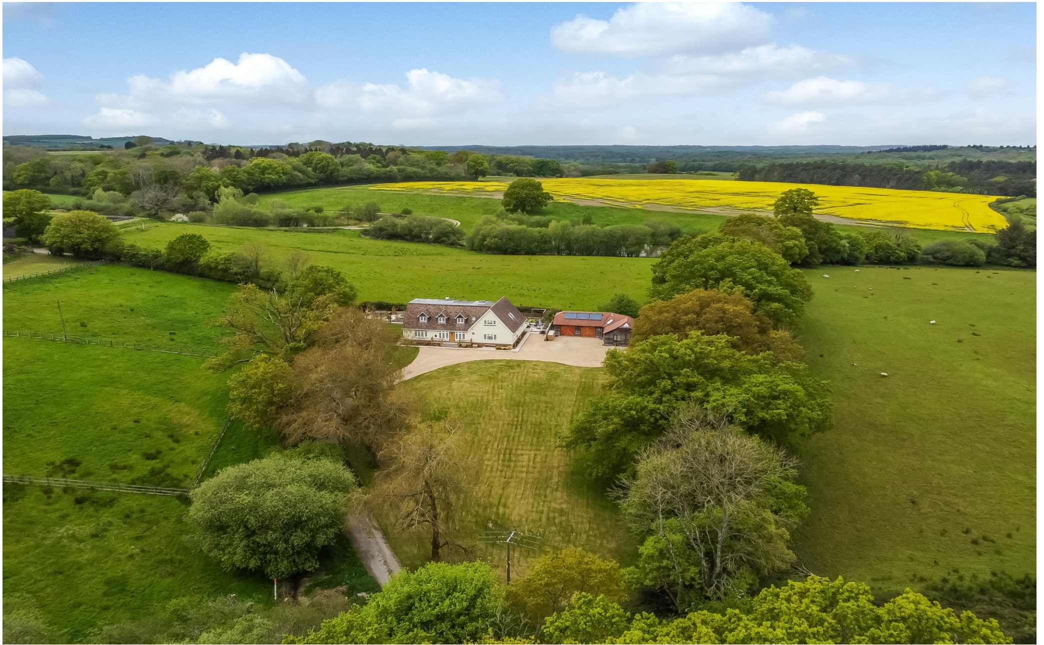
Willow Bank House, Saunders Lane, Awbridge, Romsey SO51 0GP