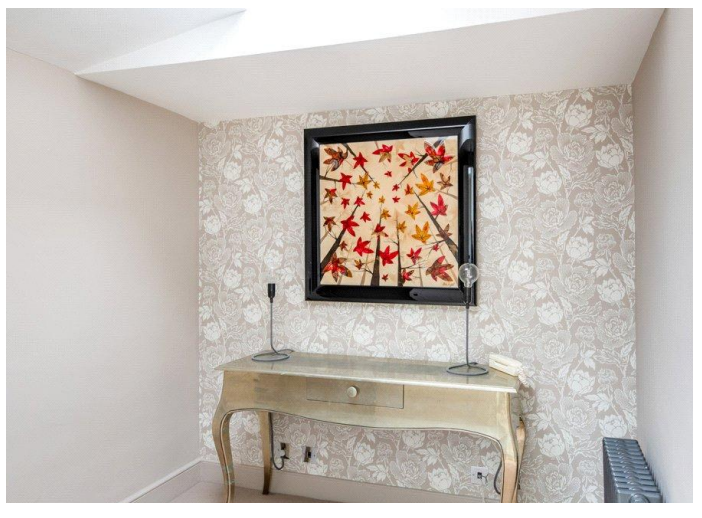
Top Floor Flat, 17 Brock Street, BATH, Bath, Somerset, BA1 2LW Asking Price £385,000 share of Freehold

Entrance Hall | Kitchen | Living room | Bathroom | Large double bedroom | Park views | Residents parking permit available.