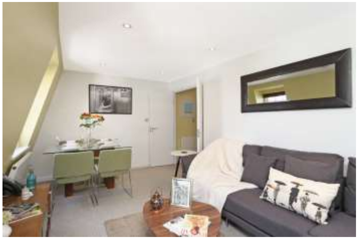
WYNDHAM STREET, MARYLEBONE, W1H £895,000 LEASEHOLD

LOCATED IN W1H - MARYLEBONE, A WELL PRESENTED, LEASEHOLD, PLUS SHARE OF FREEHOLD, TWO BEDROOM, TWO BATHROOM, OPEN PLAN, THIRD FLOOR APARTMENT. SET IN A HANDSOME GRADE II GEORGIAN BUILDING AND ACCESSED THROUGH A SEMICIRCULAR ARCHED MAIN FRONT DOOR.