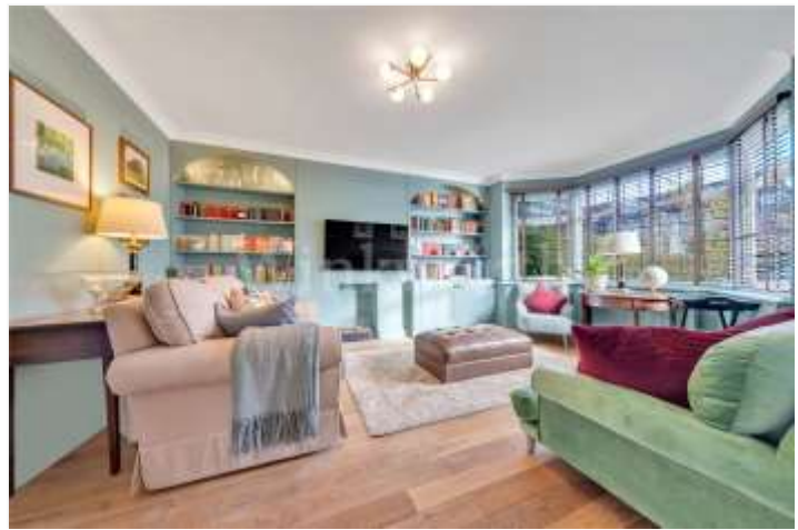
CRICKLEWOOD LANE, NW2 £1,150,000 FREEHOLD