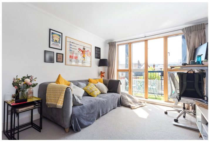
FOLGATE STREET, E1 £2,900 PER MONTH UNFURNISHED