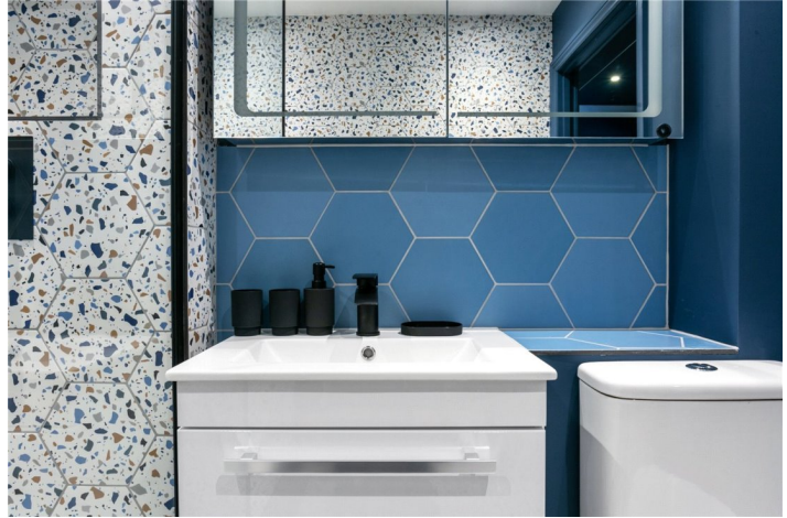
WOODSEER STREET, LONDON, E1 £2,000 PER MONTH